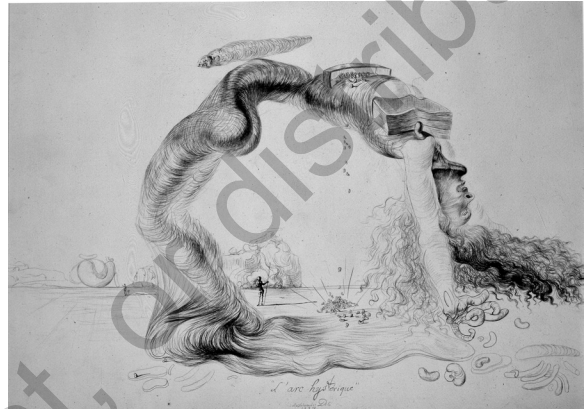
Salvador Dalí, L'Arc Hystérique (Hysterical Arch), 1937 ink on paper, image: 22 in × 30 in.

When seeking new possibilities, premature evaluation and the application of judgment block the imagination. This has been demonstrated by research. 14 In one of the earliest investigations into creativity training, two groups of students were