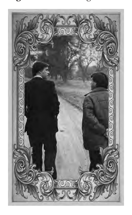
Figure 3 Labor Targeted Message to Latinos for Jerry Brown, 2010