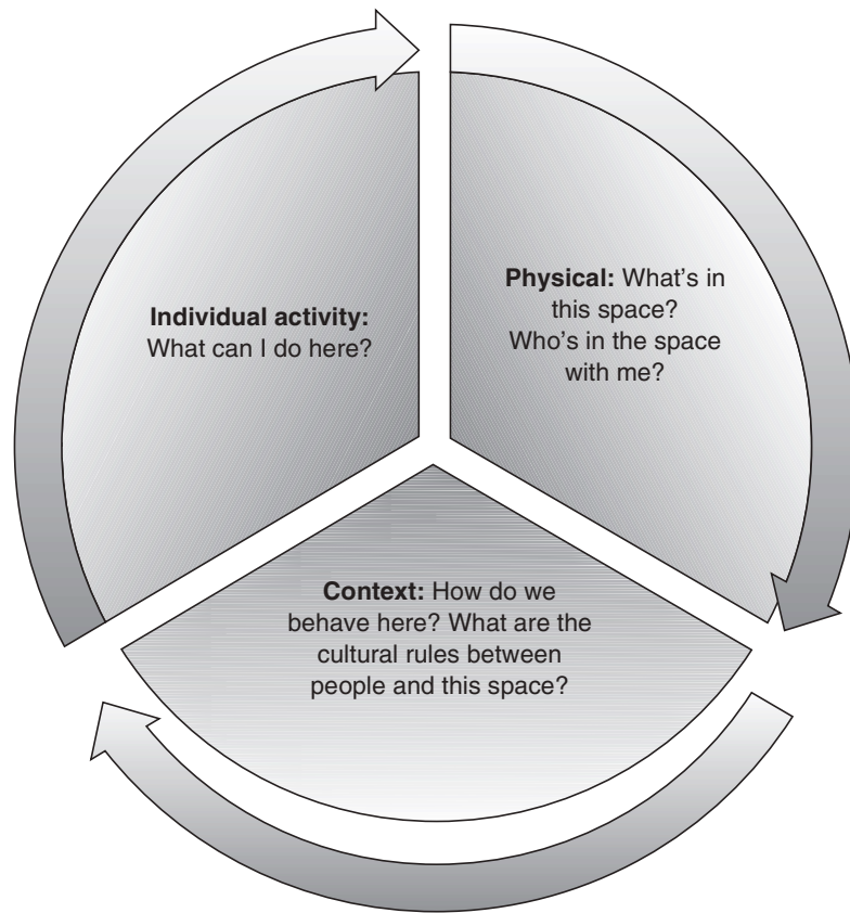
Figure 2.1 Individual, physical and contextual aspects of a space

The term ‘affordance’ is often used to describe the possibilities for action that a physical object or space offers to a particular individual, but, as the foregoing suggests, any such interaction between object and individual is mediated by the cultural context in which the meeting takes place (see Box 2.3). In order to fully appreciate spaces and what they offer, then, we need a model that allows us to conceptualise the contextual as well as the physical space in which an individual acts; Figure 2.1 represents these aspects of a space.