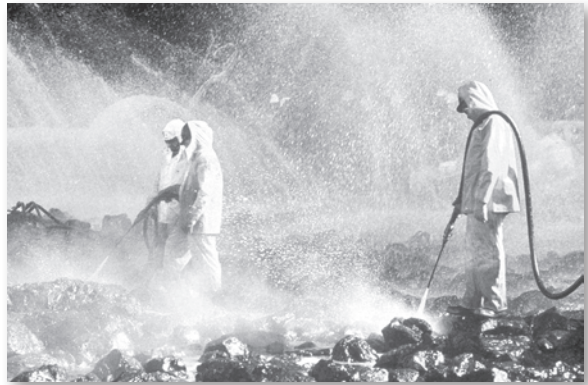
▲ Photo 2.2 In the aftermath of the Exxon Valdez grounding, workers worked tirelessly to eradicate harmful effects of the white-collar offense. Researchers have not yet been able to identify the full extent of the consequences of this disaster.

Death or serious physical injury is also a possible consequence of white-collar crimes. In one case, for instance, seven people died after a doctor “used lemon juice instead of antiseptic on patients' operation wounds” (Ninemsn Staff, 2010). In another case, Reinaldo Silvestre was running a medical clinic in Miami Beach when it was discovered that he was practicing without a license, using animal tranquilizers as sedatives for humans, and performing botched surgeries. In a widely publicized case, a male body builder