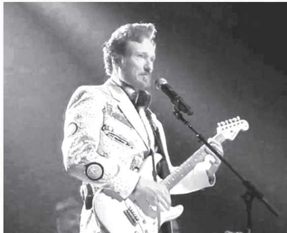
▲ Photo 2.3 After his dispute with NBC, Conan O'Brien mocked his employer, joking about ways he could waste the company's money.

For some students, the numerous careers available to respond to white-collar crime might also be seen as a positive. Whenever I teach my criminal justice classes, I always ask my students if they would make crime go away if they could. Seldom do any students indicate that they would make crime disappear. In their minds, if they made crime disappear, they'd have to change their majors! So, in some ways, white-collar crime helps keep some criminal justice officials employed. A few of these careers can be particularly lucrative—one defense attorney was recently paid $50,000 simply for providing counsel to a white-collar worker who had to testify in a grand jury proceeding (Nelson, 2010).