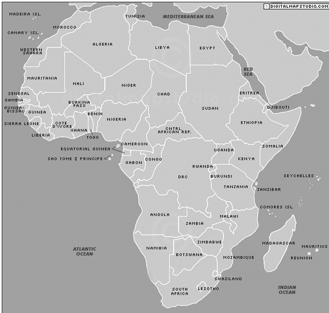
Figure 2.3 Map of Africa

The Out of Africa hypothesis claims that modern humans first evolved in then migrated out of Eastern Africa about 150,000 years ago 7 .