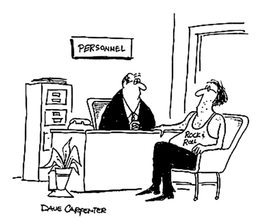
"OH! ... YOU DID DRESS UP FOR THE INTERVIEW."