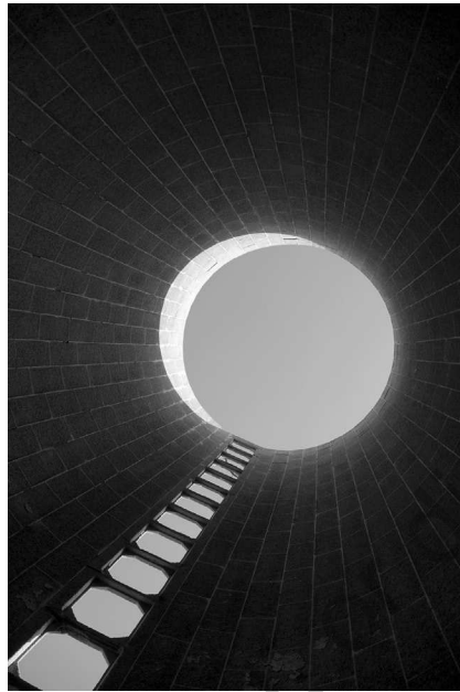
FIGURE 1.1 ■ View From Inside a Silo