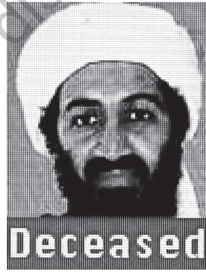
Osama bin Laden. Bin Laden was killed during a raid by a U.S. naval special forces unit in Abbottabad, Pakistan, on May 2, 2011.