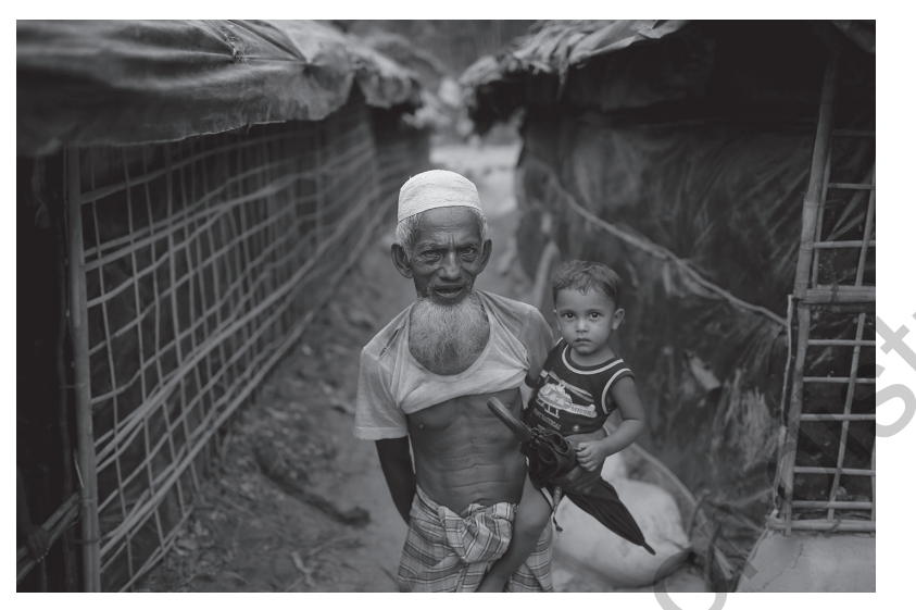
An elderly Rohingya Muslim man carries his grandson as they walk in an alley at a camp for Rohingya people in Ukhiya, near Cox's Bazar, a southern coastal district 296 kilometers (183 miles) south of Dhaka, Bangladesh.

genocides of the Nazi Holocaust (pseudo-racial), in the killing fields of Cambodia (social and ideological), in Rwanda (ethnic and social), in the Darfur region of Sudan (ethno-religious), and against the Rohingya people in Myanmar (ethno-religious).