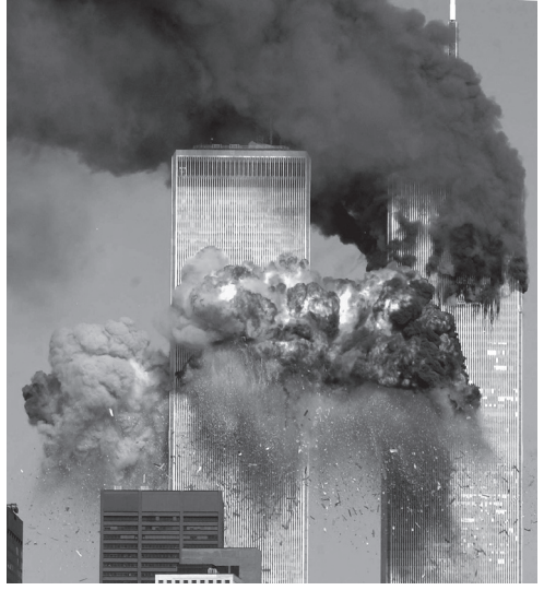
Hijacked United Airlines Flight 175 from Boston crashes into the south tower of the World Trade Center and explodes at 9:03 a.m. on September 11, 2001, in New York City.