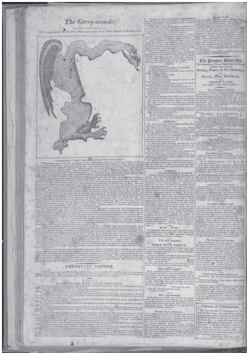
Elbridge Gerry's original "gerrymander"