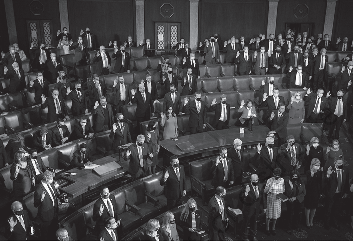
House members being sworn in