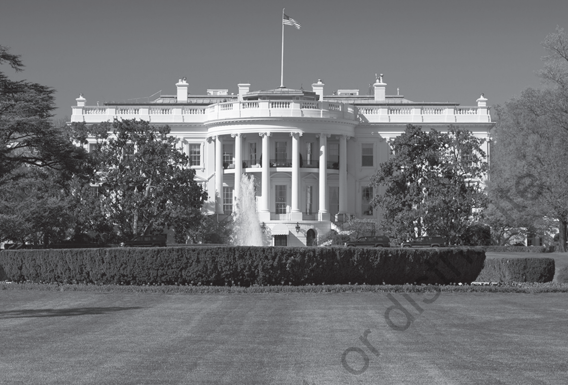
PHOTO 1.1 The White House—nerve center of the executive branch and home of its chief.