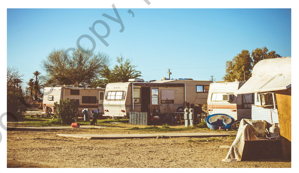
Lower-income communities have a limited number of trees and parks and significantly more concrete.

In the United States, the wealthier a neighborhood, the greener the views and the more shade people experience, which lowers the average outdoor temperature, enabling those living in such neighborhoods to lead healthier lifestyles, in part because they're able to spend more time outside and breathe cleaner air. Lower-income communities have a limited number of trees and parks and significantly more concrete. The presence of more greenery has been shown to improve mental health, educational outcomes, and social connectivity. In the United States, trees cover about one-third of the surface in communities described as "white" and barely one-fifth of the surface in communities populated by people of color—exposing social equity issues correlated with identity. In 2019, approximately 16 percent of all people of color lived in high-poverty neighborhoods, and this number increased to 20 percent for Black and Indigenous Americans. This stands in sharp contrast to the only 4 percent of white people who live in such neighborhoods.