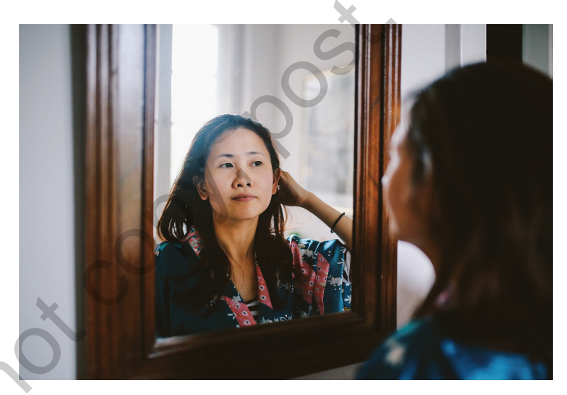
Identity is about how we see and conceive of ourselves.

Identity, however, also depends on others' perception of us. Since we each perceive the world through our own individual lens, not everyone sees us as we see ourselves. Others may challenge our notion of self, negotiating with us to work out the conflict by co-creating an identity that can coexist somewhere between our avowed identity (how we identify ourselves) and our ascribed identity (the identity others attribute to us).<sup>34</sup> Now, think about your avowed identity. In what areas, if any, does your avowed identity match your ascribed identity? In what circumstances are they most likely to differ? Do they converge when it comes to your physical characteristics? Do they diverge when it comes to personality or values? When we communicate with someone we don't know very well, what identity are we most likely to ascribe to them? What identity are they most likely to ascribe to us? Identity has many faces; it is dynamic and plays a major role in our interactions with others, especially when it comes to intercultural communication.