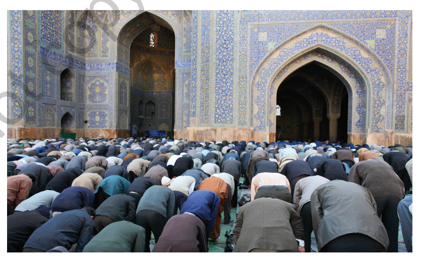
What role, if any, does religion play in your identity?

Though in some countries religion is a private matter, based on the principle that church and state are separate, in others, religion and the state are inseparable, with religion being an integral part of the state's power structure and publicly practiced. The armed conflicts precipitated by religious differences between the Protestants and Catholics in Northern Ireland and between Jews and Muslims in the Middle East are a testament to the difficulties experienced when attempting to negotiate religious identity. For example, European national identities tend to be described in terms of ethnic and religious ancestry. Thus, in Europe, non-Christian youth associate less strongly with their national identities than Christian youth. Muslim youth show the lowest levels of identification.