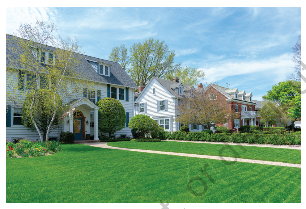
Wealthier neighborhoods usually boast more shade and greenery.