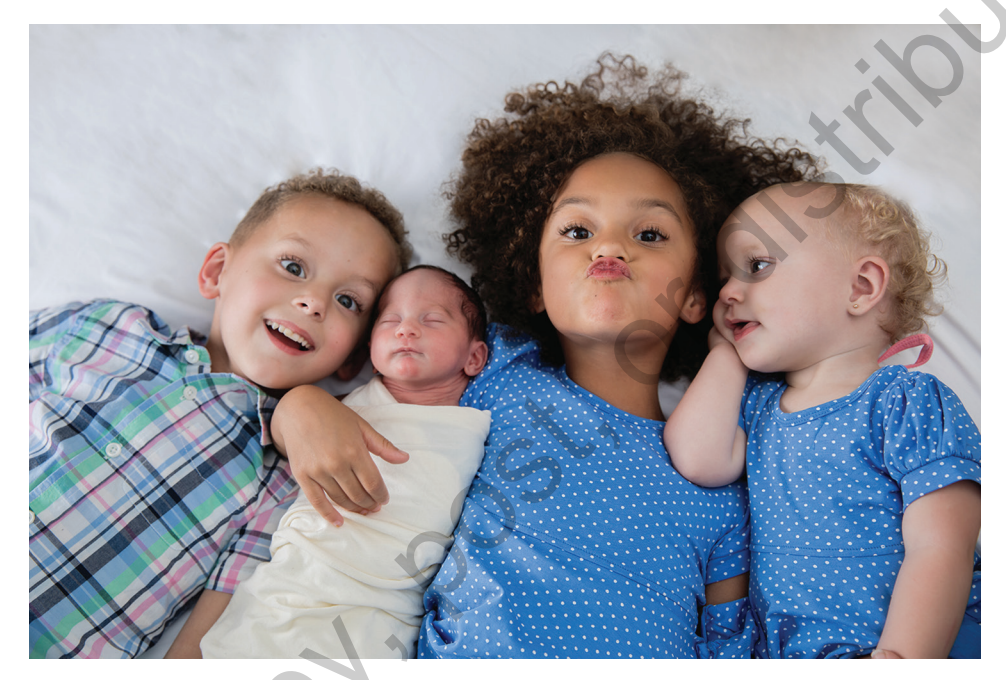
The number of people who identify as multiracial is increasing.

that is both flexible and adaptable. If one group with which they identify is dominant and another is an underrepresented group, they can embrace both dominant and underrepresented racial identities, feeling both privileged and marginalized.<sup>102</sup> Again, multiracial and multicultural identity development inevitably echoes the need for understanding identity through intersectionality, acknowledging that people can simultaneously experience privilege and oppression.