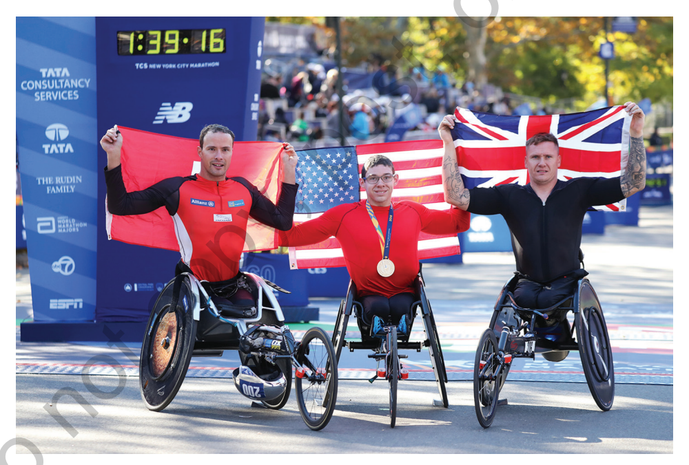
What role do athletic competitions play in identity?

means understanding how standpoints differ. According to standpoint theory, a standpoint is what people use to perceive and make sense of the world.<sup>21</sup> A person's standpoint determines what they see. What someone sees, fails to see, or prefers to see is also affected by the power they hold in society. Traditionally, the standpoint of people belonging to underrepresented groups and those possessing less power is often ignored and overlooked by those from the macro- or dominant cultural groups. Therefore, developing understanding for the standpoint of people who belong to one or more co-cultures enables individuals who identify with more powerful groups to develop a more comprehensive picture of the reality and humanity of co-culture members. Recall the example from the last chapter of a cartoon designed to pay tribute to Stephen Hawking's passing by depicting a man walking away from his wheelchair toward the lights, with the implied title of "finally free."22 The cartoon views a person from the disabled culture from the standpoint of the able-bodied culture. The well-intended effort revealed a gap in the able-bodied-centric worldview, the assumption that the life of a person who uses a wheelchair must be incomplete, and their life only can be full and complete when death releases them from this constraint. This standpoint inevitably reduces a person's identity to a single dimension, devaluing their humanity.