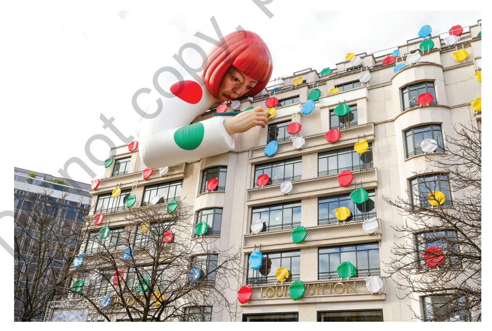
A Yayoi Kusama art installation decorates Louis Vuitton's Paris flagship store.

Advertising is characterized by the use of "push," or one-way, message strategies to get messages across to audiences, while public relations uses a "push-pull," or two-way, dialogue designed to build mutually beneficial relationships. The main effect of the advertising collaboration between Louis Vuitton and Yayoi Kusama, for example, was to push the clothing brand's messages out to the public through a creative art outdoor campaign. Little feedback returns from audiences directly to the brand unless it is through sharing content and commenting on this work on social media.