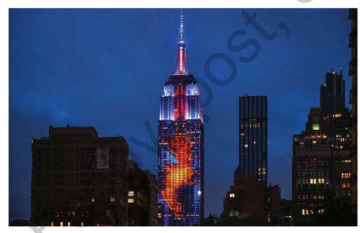
Giant Spoon's Stranger Things promotion lights up the Empire State Building.

One way to generate buzz about a company and brand is not only to have a strong word-of-mouth campaign but also to create online and offline buzz about an upcoming event, campaign, or brand. This was the case for the fourth season of Netflix's popular show Stranger Things . The streaming service partnered with Giant Spoon, an agency known for its creative and innovative approaches to campaigns and creative executions, to generate both online and offline traction for the upcoming show release, including an interactive display of the show's characters on the Empire State Building.