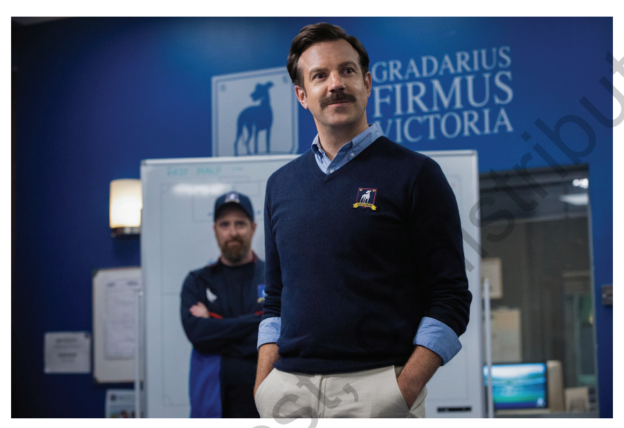
Ted Lasso's characters come to life on screen and online.

to brands and individuals with the hashtag #RoastMe. Ted Lasso 's team of writers did not partake in Roast Day, instead asking audiences how Ted Lasso could toast them in kindness using the hashtag #ToastMe. All told, the Ted Lasso team created a community built on relationships across different channels and focused on positivity, goodness, and entertainment through interactive storytelling.