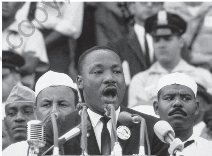
How did Dr. Martin Luther King Jr. change social reality with his “I Have a Dream” speech?