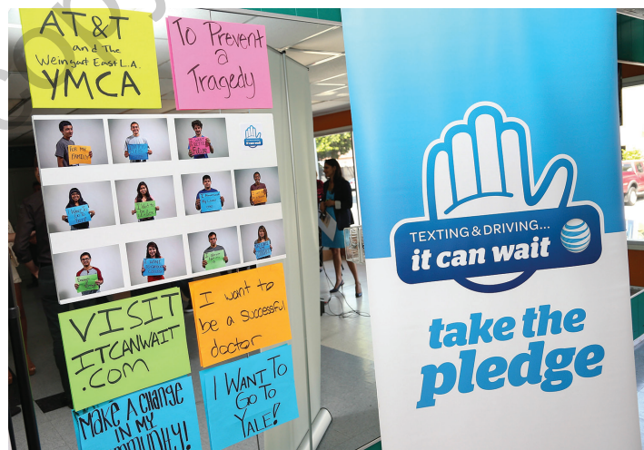
Distracted driving is a problem both caused and solved by communication technology.

Virtual worlds and augmented realities (a blend of physical and virtual realities) are already popular formats for games and other forms of entertainment. In the near future, our lifestyles may involve a seamless transition from virtual reality, artificial reality, and what we call “real life.” As you read each chapter in this book, you will encounter a feature titled “Screen Break,” which discusses situations in which the older, more traditional mode of communicating face to face, through the basic media of body and voice, may be preferable to using newer, computer-mediated forms of communication. Face-to-face communication is a powerful but potentially underutilized form of relating with others.