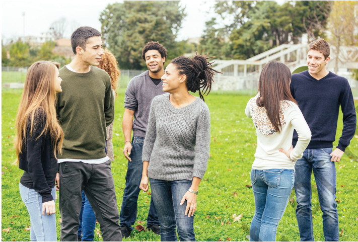
Communication allows us to participate in social reality.