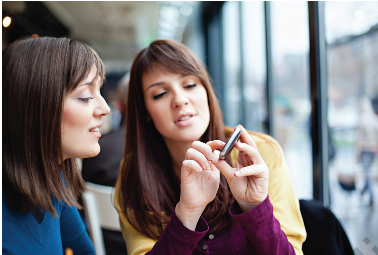
A competent communicator uses messages effectively and appropriately.