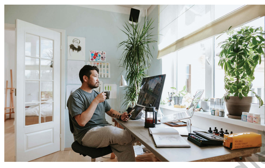
When a large portion of the workforce started working from home due to the COVID-19 pandemic, many organizations' dress codes became less formal.