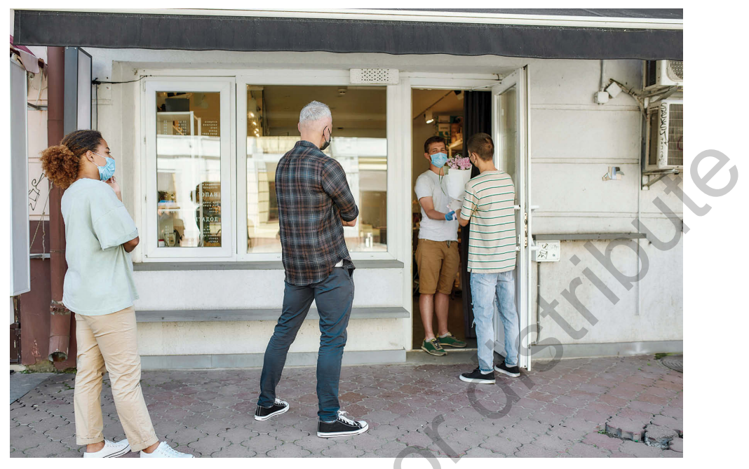
People became increasingly aware of space and distance during the COVID-19 pandemic.