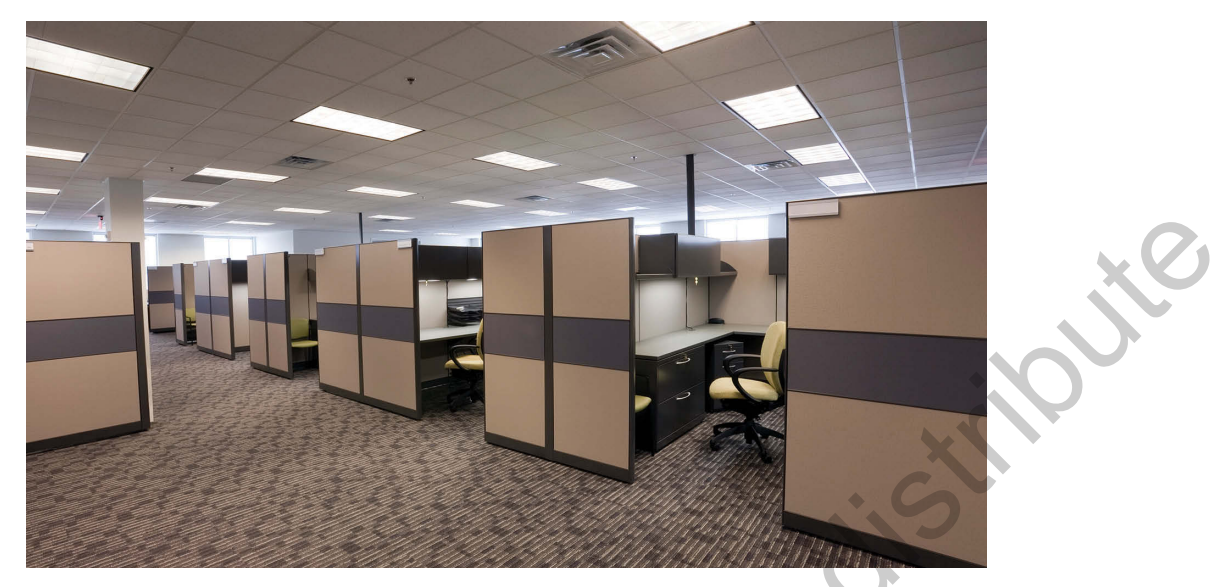
People are influenced by their environments. What are the nonverbal messages in this professional office environment that could impact communication?