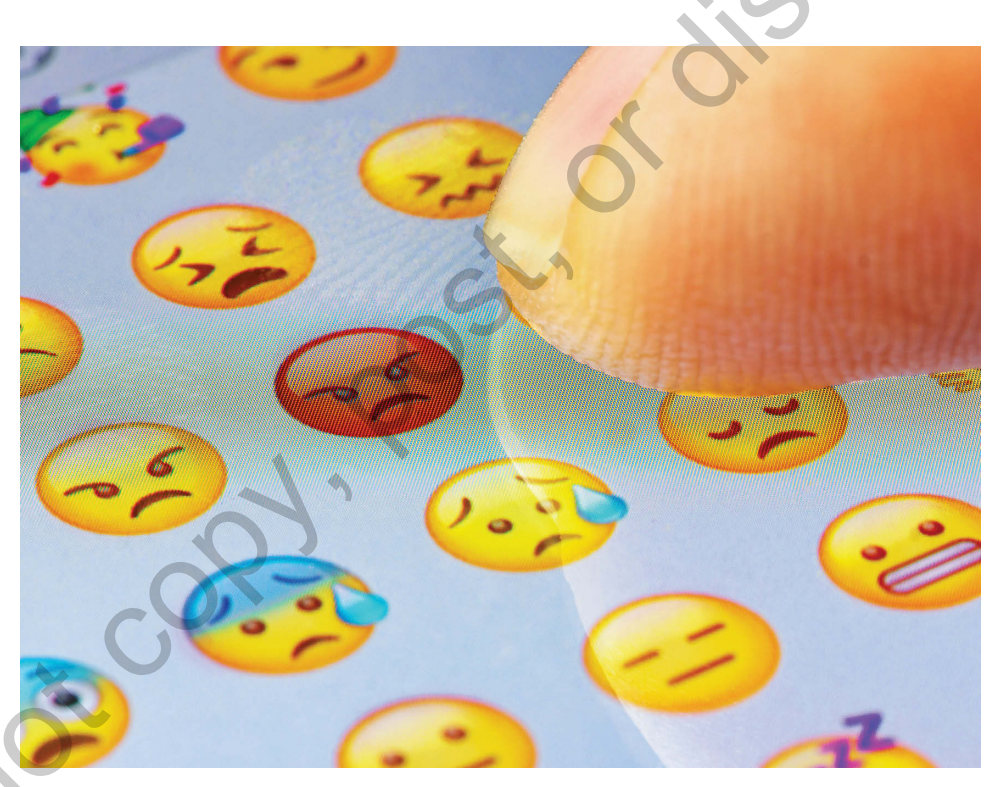
Does it ever feel like you spend forever choosing the right emoji when messaging somebody? Emojis can be an effective tool in nonverbal communication because they communicate attitudes and tone which can be difficult to convey through writing.

Argyle (1988) suggested that nonverbal behavior serves four purposes. The first function is to express emotion. Consider a moment when you may have had a conflict with a friend or family member. When that person asked you what was wrong, you probably responded, "Nothing," but you could not control your facial expressions, which indicated otherwise. Displaying appropriate emotion is vital to professional excellence. One should show passion and drive but also demonstrate resilience and be able to triumph over day-to-day disappointments in the workplace. Could you imagine a classroom environment where students displayed extreme emotion each time they received a grade that was lower than expected? How do you think your productivity would be affected?