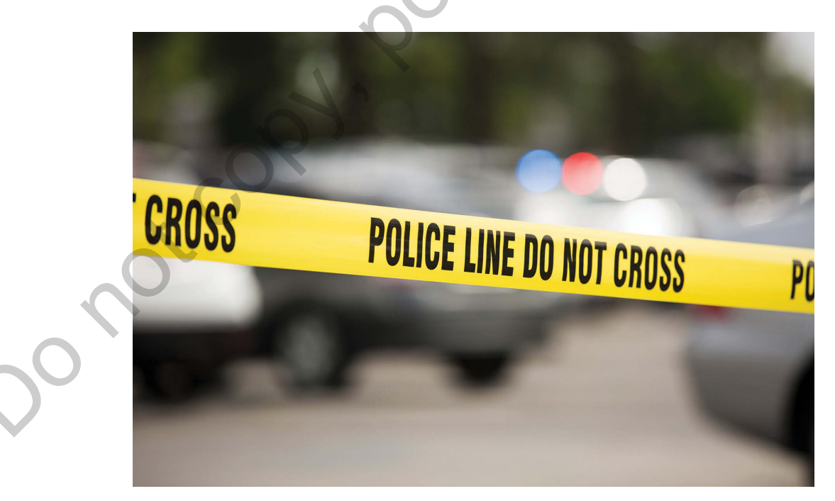
Television shows like NBC's Law and Order can shape our general perception of various professional roles. In your view, do you think the verbal and communication skills (or a lack of them) portrayed by characters in television shows influence our expectations of medical as well as other professionals?

A study has indicated that lawyers can project a favorable impression of themselves and their firms for prospective clients through sustained eye contact and other forms of body language, such as an erect but relaxed sitting position and close proximity to the clients (Clarke, 1989).