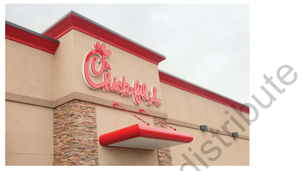
Companies within the service and food industries often compete to provide the best products and service to their customers. Chick-fil-A is well known for its focus on customer service. What does good customer service look and sound like?