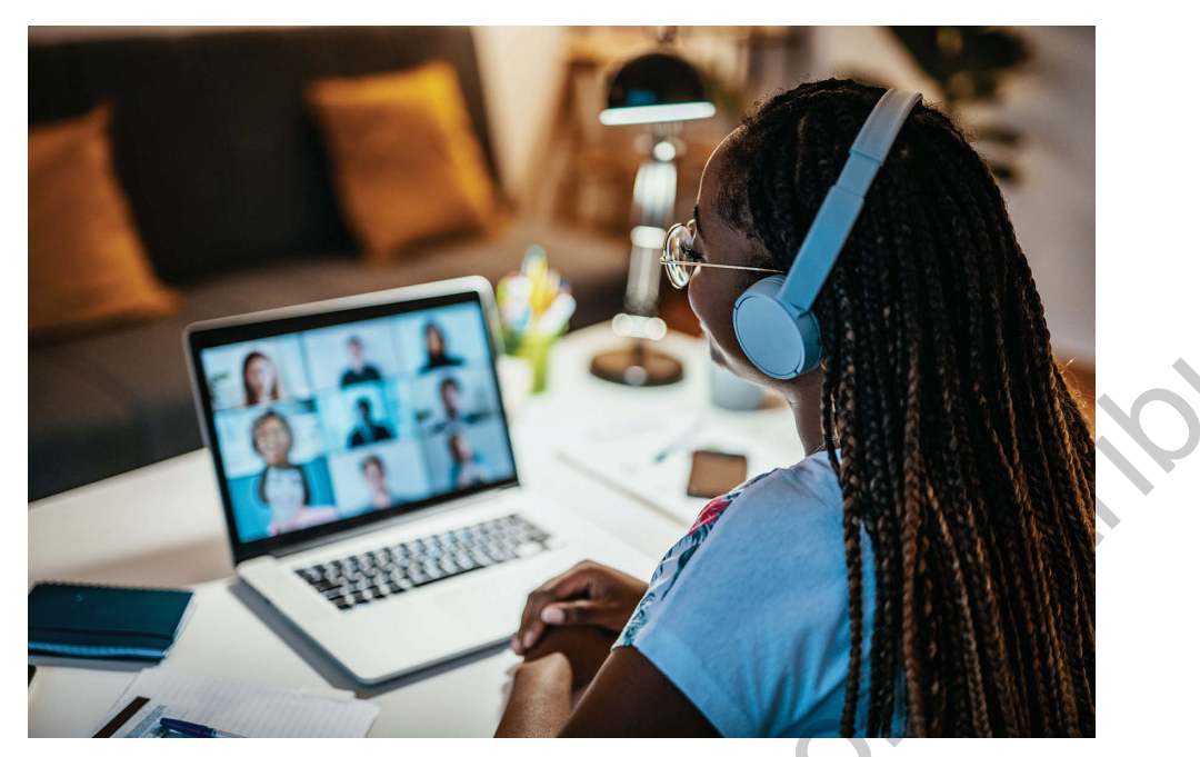
"You're on mute!" Verbal communication in collaborative work groups is essential in both face-to-face and mediated contexts, but when verbally communicating over video conferencing tools such as Zoom, technology sometimes becomes an unexpected barrier.