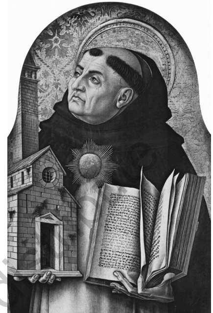
Saint Thomas Aquinas by Carlo Crivelli, 1476.