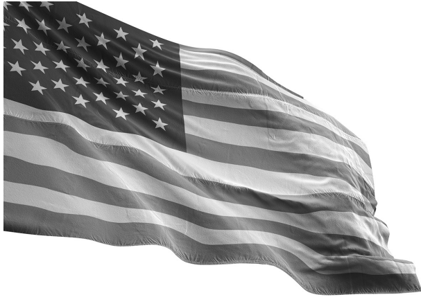
PHOTO 2.3 What comes to mind when you think of American culture? What do you think is the relationship between law and culture in the United States?

A recent focus of law and society is how popular culture and personalities influence the law (Sherwin 2000). In the trial of Roger Stone, an intimate of President Donald Trump, the prosecution unsuccessfully attempted to use an excerpt from the iconic film The Godfather to make a point about witness tampering, thinking that this was the most effective way to communicate with the jury (LaFraniere 2020; Sherwin 2000).