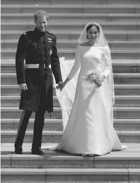
The wedding of Prince Harry and U.S.-born Meghan Markle had elements of both cultures with a gospel choir and U.S. Episcopal bishop Michael Curry who references African-American spirituals and Black enslavement.

study identified the intercultural communication competencies in international marriages: