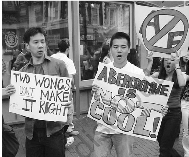
Asian American Resource Workshop

Calcutta-born journalism professor Suketu Mehta (2014) charges that such claims of superiority for "model minorities" is simply a new form of racism. The implication is that other cultures are inferior and unable to succeed. Mehta also contends that such claims now based on culture follow a century of discredited claims of superiority based on race, class, IQ, and religion.