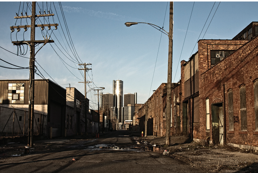
What aspects of this neighborhood would cause it to be classified as “disorganized”?

Lombroso did not account for an important z factor—namely, associates or friends who also had tattoos. This z factor caused the simultaneous occurrence of both other factors.