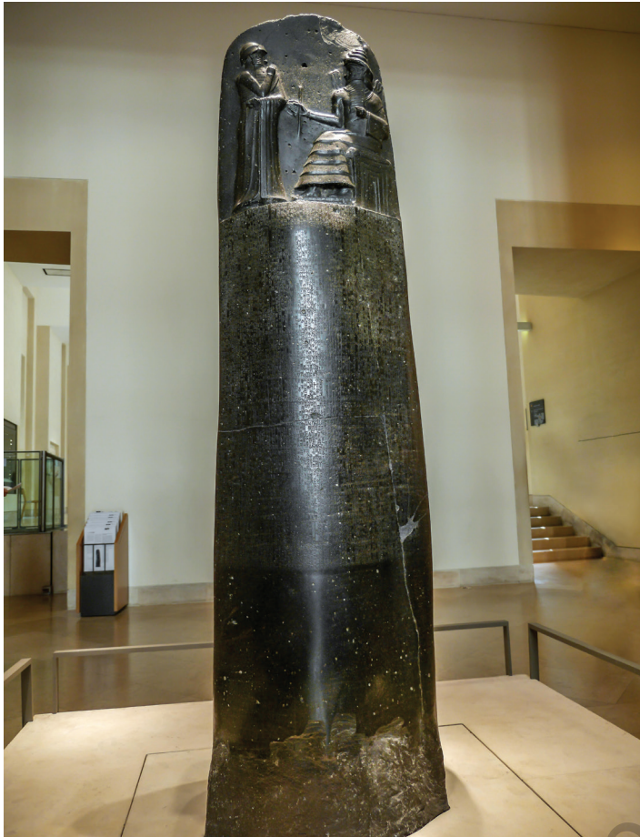
The Code of Hammurabi was inscribed on a seven-foot basalt stele. It is now on display in the Louvre in Paris, France.

victim impact statements: formal statements given by victims in court about the incident in which they were offended, often in person but also in other ways (e.g., a video or written statement read by the court reporter); these statements may be considered in determining the offender's sentence.