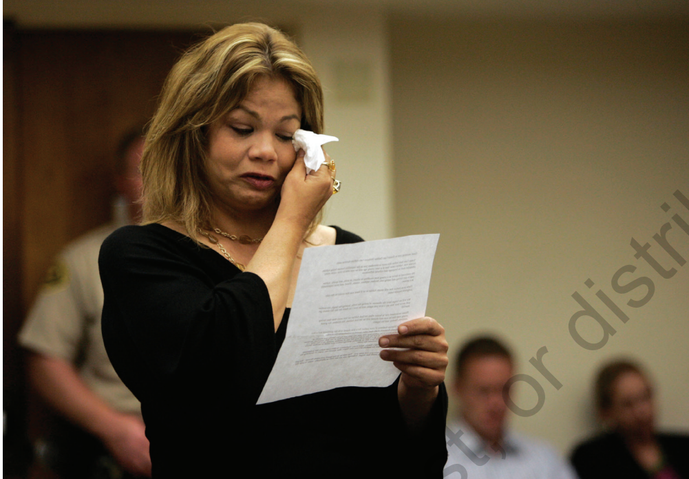
A woman reads her victim impact statement during sentencing. Should the impact a crime has on a victim be given more consideration during a trial and sentencing?

victim impact statements are largely deemed significant and important contributions to the judicial process (as the U.S. Supreme Court agrees), if only to provide a voice and some closure for victims and their families.