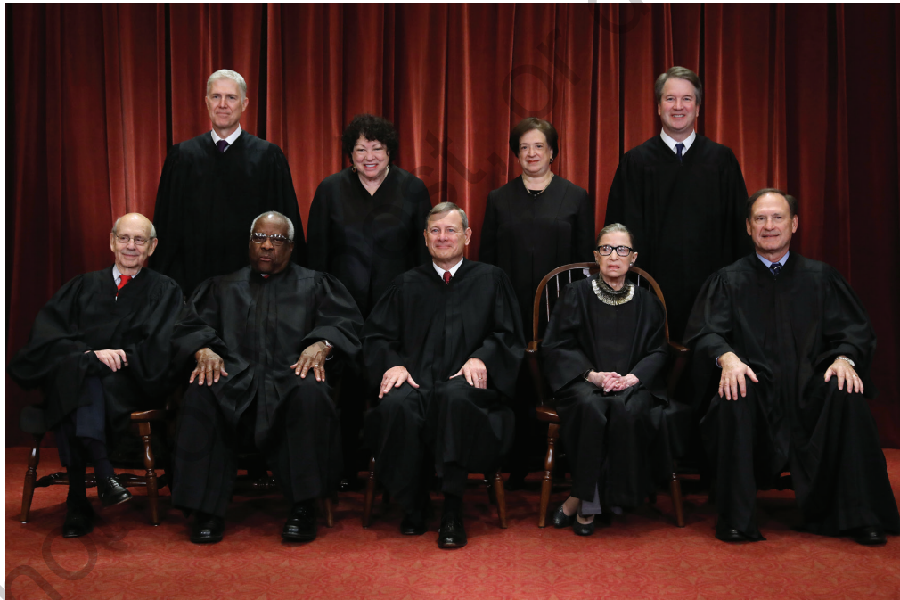
The U.S. Supreme Court in 2019. Front, left to right: Associate Justice Stephen Breyer, Associate Justice Clarence Thomas, Chief Justice John Roberts, Associate Justice Ruth Bader Ginsburg, Associate Justice Samuel Alito, Jr. Back, left to right: Associate Justice Neil Gorsuch, Associate Justice Sonia Sotomayor, Associate Justice Elena Kagan, and Associate Justice Brett Kavanaugh.

Every court, including the U.S. Supreme Court, is limited in terms of jurisdiction.