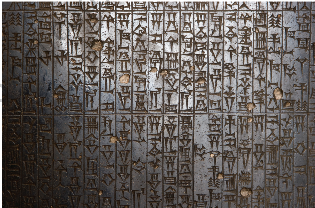
The Code of Hammurabi, written in about 1780 B.C.E., set out crimes and punishments based on lex talionis —“an eye for an eye, a tooth for a tooth.” It is the earliest-known example of a ruler’s setting forth a body of laws arranged in orderly groupings.

Confusion sometimes surrounds the definition of specific crimes and criminal justice system responses. We might hear someone screaming, “I’ve been robbed!” on television or in the movies after returning home and discovering that his house has been entered and ransacked (he was not robbed; he was burglarized). Or, someone discovers a dead body and exclaims, “He’s been murdered!” A person may have indeed been killed, but many killings are not criminal in nature; only a judge or jury can decide if a murder has taken place. News reporters commonly mistake jail for prison and might erroneously state, “John Jones,