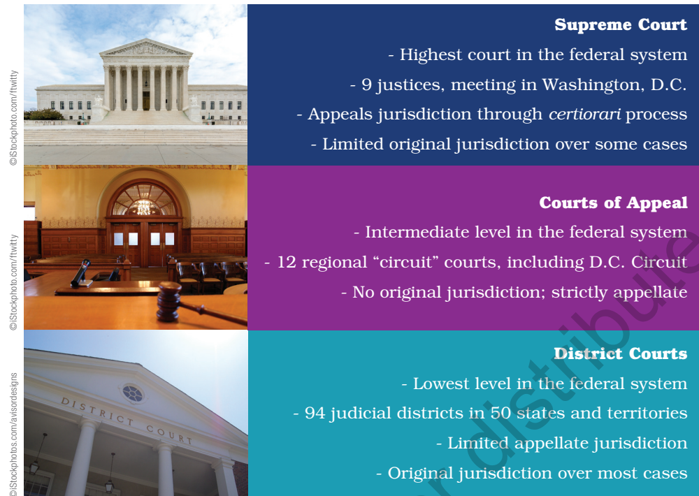
Figure 2.1 /// Three-Tier Structure of the U.S. Federal Court System

Again, terminology is critical to understanding law. Generally speaking, a statute is a law enacted by Congress (a federal law) or by a state legislature (a state law). Statutes are also known as statutory law . A code or ordinance typically refers to a law enacted by a local law-making body—a county board or a city council, for example (municipal laws). These and other types of laws are prioritized as follows: