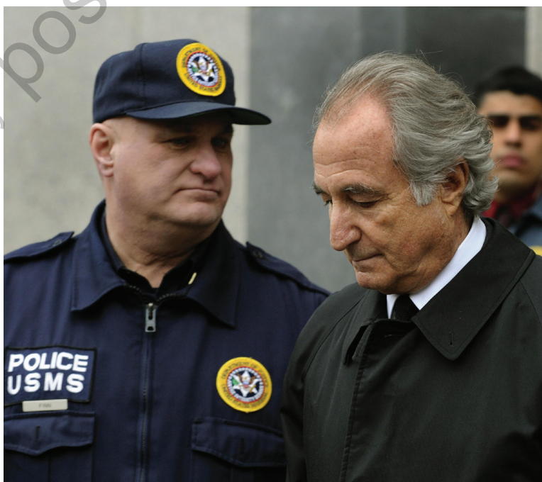
Bernie Madoff, a former stockbroker and financial advisor, was convicted of operating a Ponzi scheme that is considered to be the largest of its kind in U.S. history.