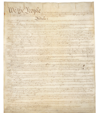
U.S. National Archives and Records Administration

Burden of proof: the requirement that the state must meet to introduce evidence or establish facts.