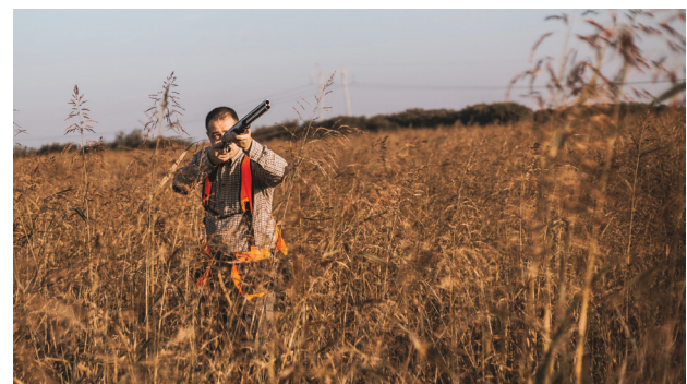
A hunter who accidentally (without intent) shoots and kills another typically would not be charged with premeditated murder.