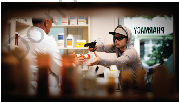
One’s criminal intent is a major consideration in our legal system; for example, one who intentionally kills someone during a robbery may well be charged with premeditated murder.

Mens rea: Latin for “guilty mind”—the purposeful intention to commit a criminal act.