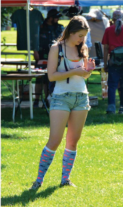
Would sending a text message be considered an act, an interaction, or a transaction?

communication as action: the act of sending messages—whether or not they are received