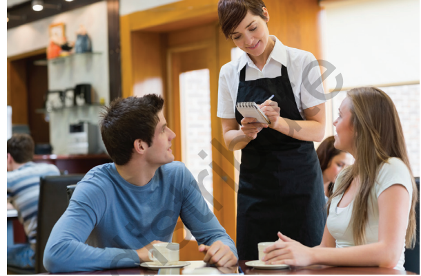
Is communication simply the exchange of messages?

True: Most of the time, people communicate without thinking, and it is not usually awkward. However, if communicating is so easy, why do people have misunderstandings, conflicts, arguments, disputes, and disagreements? Why do people get embarrassed because they have said something thoughtless? Why, then, are allegations of sexual harassment sometimes denied vigorously, and how can there ever be doubt whether one person intentionally touched another person inappropriately? Why are some family members such a problem, and what is it about their communication that makes them difficult? Why is communication via e-mail or text message so easy to misunderstand? None of these problems would occur if people who asked the previous “big deal” questions were right.