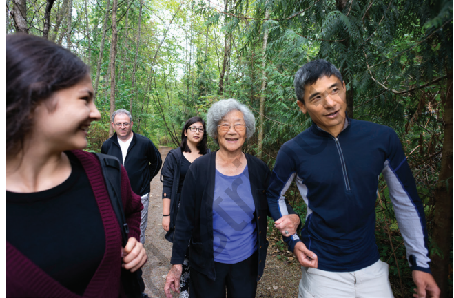
What type of communication context involves physical locations?

The situational context will also affect the meaning of a symbol. Consider the phrase “I love you” said by the same person (e.g., your mother) on your birthday, after a fight with her, on her deathbed, at Thanksgiving, or at the end of a phone call.