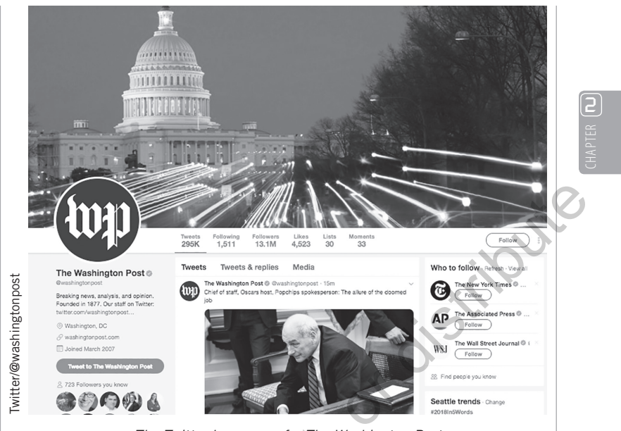
> The Twitter homepage for The Washington Post <-

Reporters are using mobile phones to post Twitter updates from breaking news events, press conferences, high school sports events and more. The 280-character limit makes it an especially comfortable medium, and it also offers an easy and effective way to capture and share photographs from the scene (see Chapter 5 for more on photography).