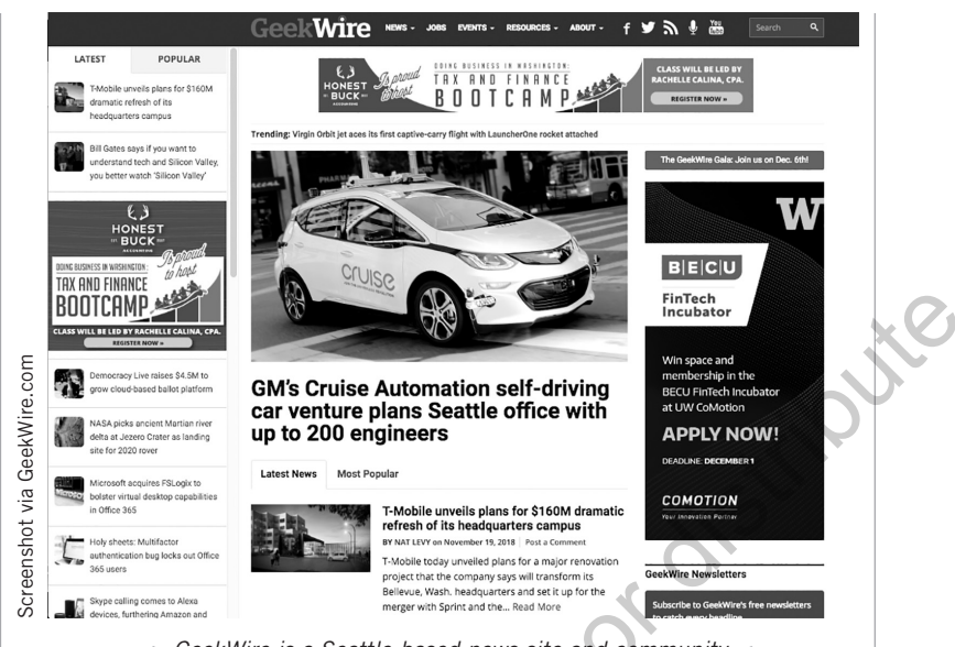
—> GeekWire is a Seattle-based news site and community. < -</p>

cover specific neighborhoods. Some have survived, including the West Seattle Blog, which has been widely recognized as one of the best hyperlocal news sites in the nation.